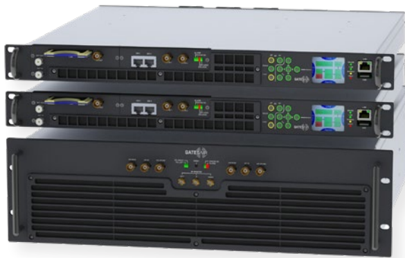
UAX-OP-800 with Dual Drive