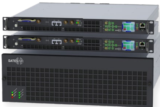
UAX-OP-2000 with Dual Drive