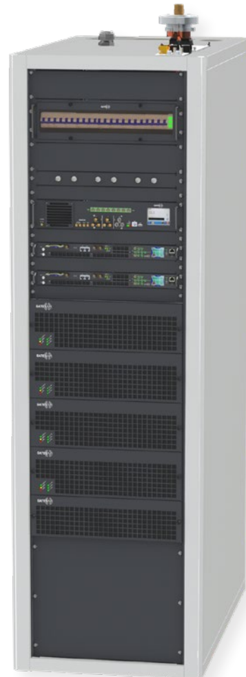
UAX-OP-7000-R36 with Dual Drive